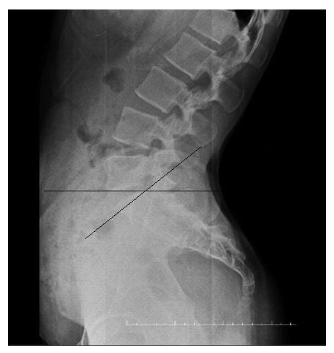
Figure 3. Lateral X-ray of the lumbar vertebrae of the patient.