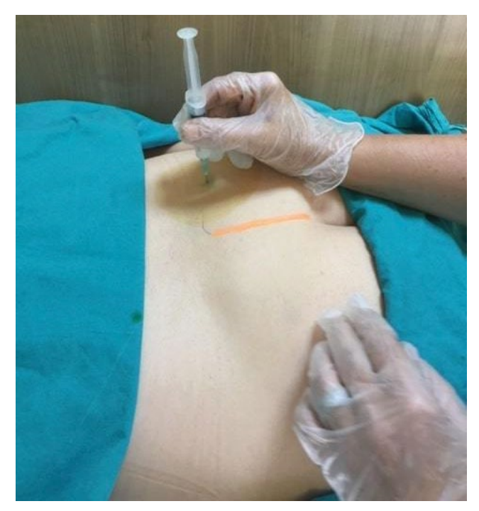
Figure 4. Superior cluneal nerve block.

scribed to the patient. The pain score of the patient was 40 mm in the control examination 1 week after. The therapeutic block of SCN was applied with 40 mg methylprednisolone and 5 ml prilocaine (Fig. 4).