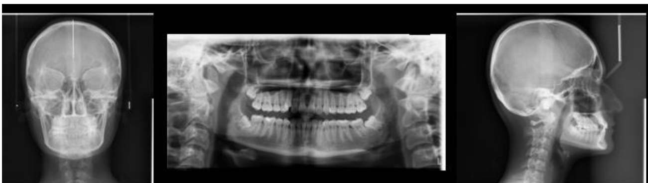
Figure 2. Pre-treatment X-rays of the patient