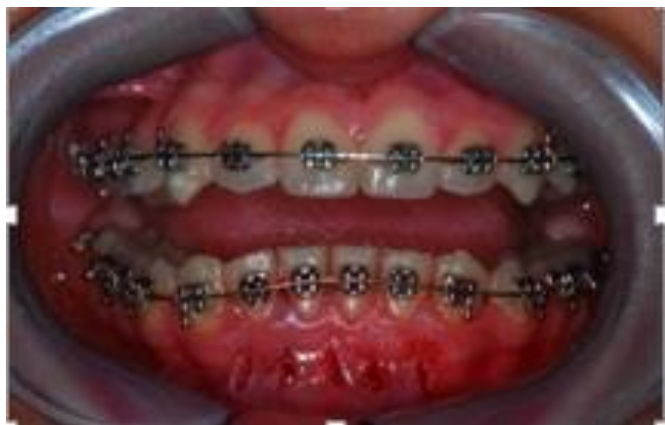
Figure 3. Piezocision application on the lower anterior region

In monthly controls, 0.016" x 0.016" and 0.016" x 0.022" Ni-Ti arch wires were applied to the upper jaw, respectively. However, thicker arch wires could not be used in the lower jaw due to the lack of leveling. Because deformation of the arch wire may adversely affect the leveling, the 0.014" Ni-Ti arch wire was renewed in the third session. It was observed that the leveling in the lower jaw was not complete at the end of a total period of 4 months. As a result, piezocision was applied to the lower anterior region (Fig. 3).