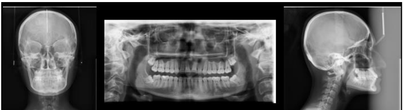
Figure 5. Post-treatment X-rays of the patient