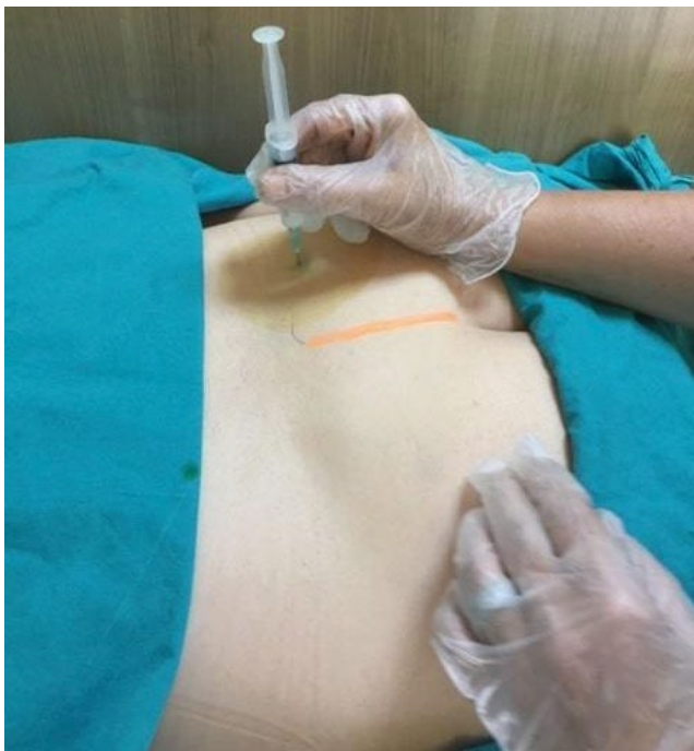
Figure 4. Superior cluneal nerve block.

scribed to the patient. The pain score of the patient was 40 mm in the control examination 1 week after. The therapeutic block of SCN was applied with 40 mg methylprednisolone and 5 ml prilocaine (Fig. 4).